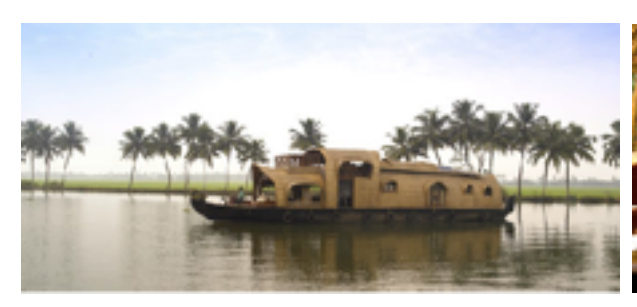
Day 15: On the Backwaters