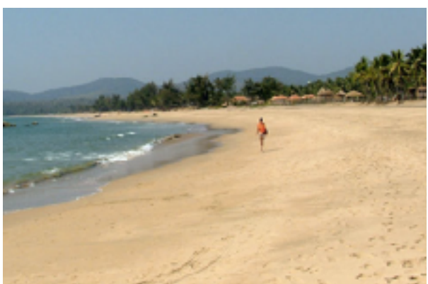
Day 17 to 19: At Cherai Beach